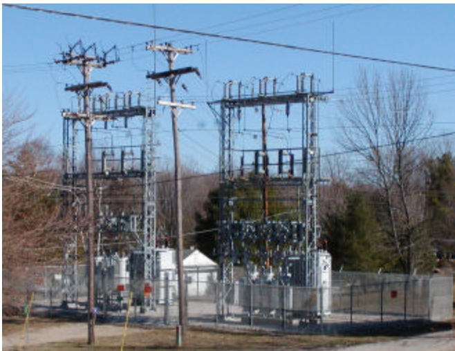
Consumer's Energy substation

Because of the importance of these non-municipal services, the continuation and expansion of them must be incorporated into the planning process for the peninsula. These services operate hand-in-hand with many municipally provided services and with other services provided by the private sector. (See Working Paper #10 for more information.)