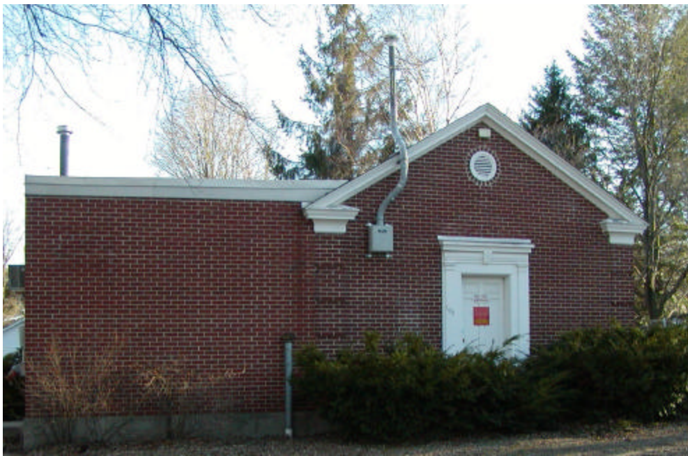
SBC Ameritech building in Northport

County and local government should encourage collocation on existing towers within the county, whenever possible, instead of constructing new towers.