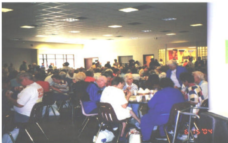
2004 Senior Expo, an event organized by the Commission on Aging

Also impacting the current delivery of human services on the peninsula is the comparatively