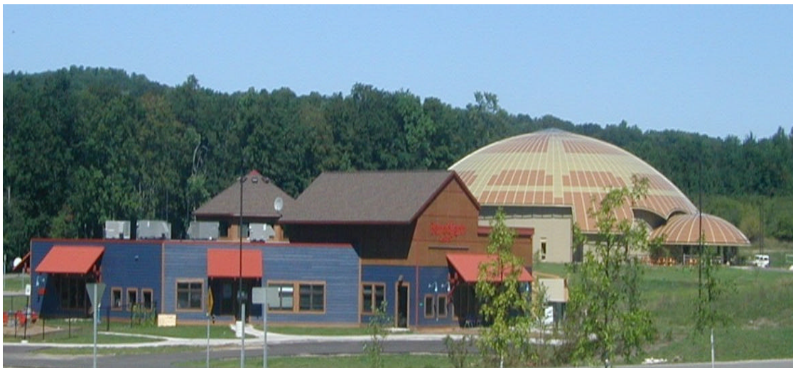
Benodjenh Headstart/daycare center and Strongheart Civic Center in Peshawbestown

Historically, a significant issue facing the county in the delivery of human services was the lack of reliable data regarding particular human service needs. This was in large part