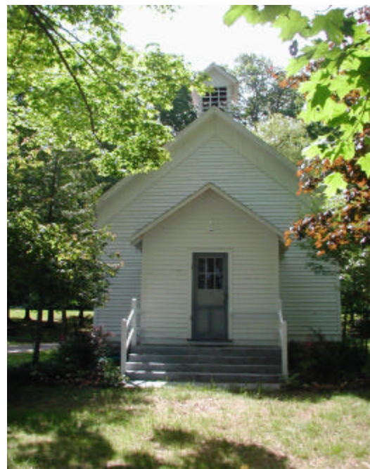
Chapel at Old Settlers Park

The County should examine existing county programs and identify and eliminate barriers to access or use of such programs by physically challenged individuals.